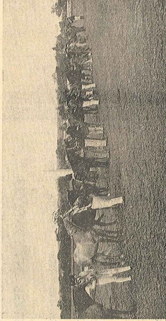
● Narrandera. Argus. Thursday September 7 1978